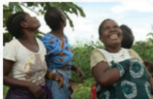
Image caption Villagers turned out to watch the first launch of the drone

"You put a payload box and a fresh battery on the drone," says Ms Santana, as she demonstrates how the device can carry up to 1kg (2.2lb) of dried blood samples in a compartment tucked under a battery. "You then open the app and select the location, you swipe and you hit take off."