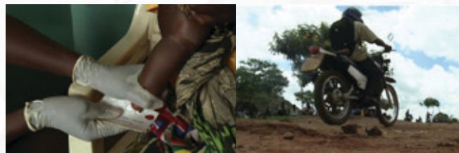
A blood sample is taken to see if children are HIV positive. Motorbikes have to travel along rough tracks to deliver the blood samples

Unlike adults, screening for the virus in children with HIV-positive mothers requires specialist laboratories that can do a sophisticated test.