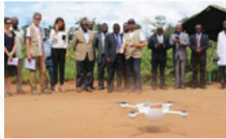
The drone can be operated through a mobile phone app