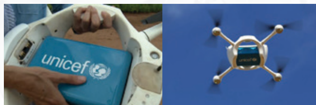
The drone can carry a payload of up to 1kg. The drone is also fitted with a parachute in case of emergencies

California-based company Matternet has designed a drone as part of an experiment being conducted in partnership with Unicef.