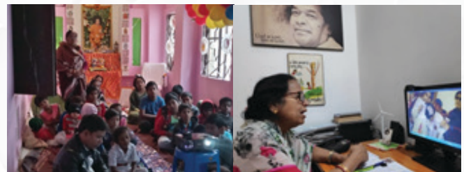
Health Class through digital connectivity for rural Bal Vikas Children of Bhadrak1 district

Sarve Santu Niramaya is a flagship programme of SSSSO, Odisha with focus on preventive health. In order to extend the outreach of the programme to rural areas where there are no doctors available, digital connectivity has been used by the organisation. Through this initiative, doctors in Bhubaneswar connect with Bal Vikas children and people of the villages and conduct health awareness classes. The organization has conducted 5 such programmes in the past 6 months and intends to conduct one in every district in the coming year.