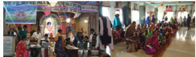
Patients at the health camp in Bhadrak

Sri Sathya Sai Seva Organisation in Bhadrak has been running a weekly health camp since nearly a decade, serving 200-300 patients every week. With active support of doctors and sevadals, digitisation of Sri Sathya Sai Holistic Healthcare Centre, Bhadrak was carried out by alumni of Sri Sathya Sai Educational institutions and youth volunteers of SSSSO, Odisha on December 17 th 2018. All patients were given a printed discharge summary and the data captured online for our database. This is the first step towards digitisation and standardisation of all health camps and holistic health care centres of the Sai organisation in Odisha