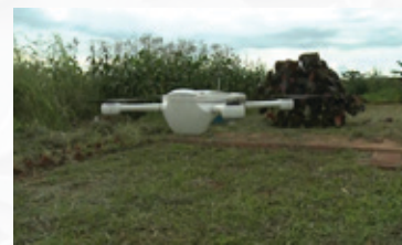
Media caption A drone is being tested to see if it can carry blood samples to the laboratory

Only half of the young people with HIV have access to treatment, and their initial diagnosis is often delayed because of the poor state of the roads.