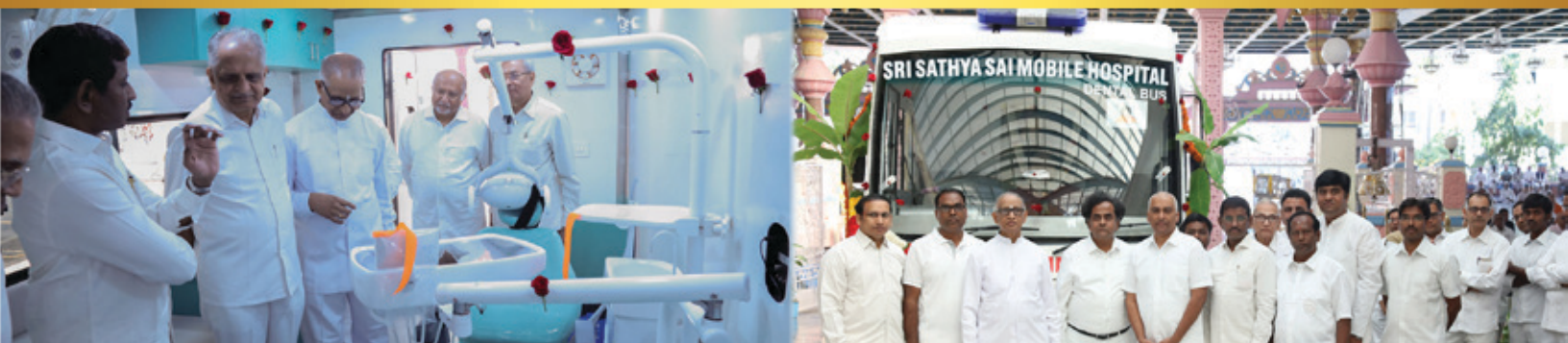
And Now- 'Dental care on wheels' - Mobile dental hospital inaugurated at Prashanthi Nilayam

“What exactly is your duty? Let me summarize it for you. First, tend your parents with love, reverence and gratitude. Second, speak the truth and act virtuously. Third, whenever you have a few moments to spare, repeat the Name of the Lord, with the form in your mind. Fourth, never indulge in talking ill of others or try to discover faults in others. And, finally, do not cause pain to others, in any form.” Baba