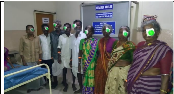
Hyd- Cataract surgeries done at Sadhuram Eye Hospital on 29.7.19